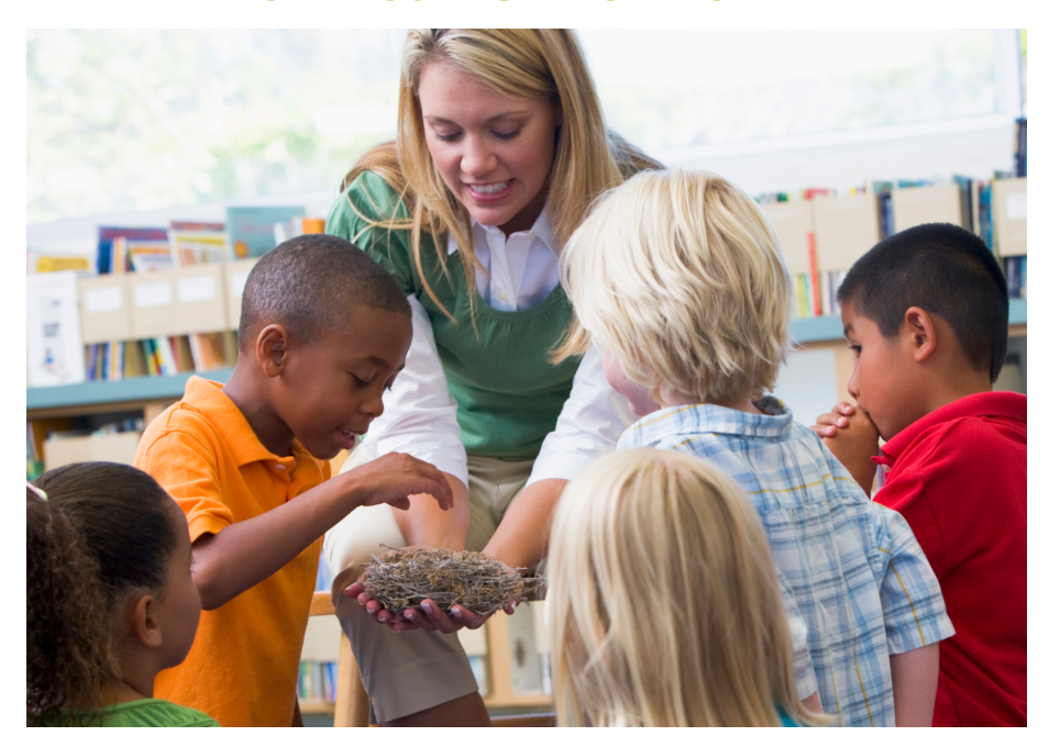
These materials were developed under a grant awarded by the Michigan Department of Education and the U.S. Department of Health and Human Services.

See if your child qualifies: (810) 364-8990 or (810) 982-8541 Toll-free 1-877-627-0422